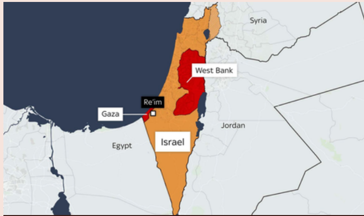
Map of Israel and State of Palestine

Tensions remain high in the Middle East, but a new peace proposal could bring a pause to the long and painful fighting between Israel and Hamas in Gaza.