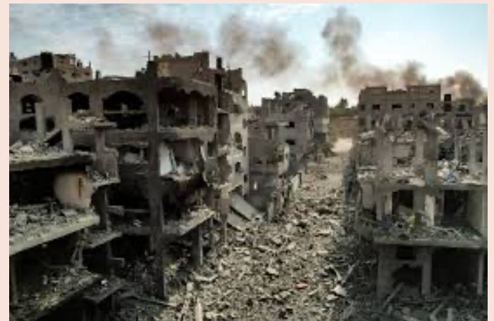
Buildings destroyed in Gaza

Recently, 30 trucks full of food entered Gaza, delivering over 1.6 million meals in a single day, more than any other day since the war began.