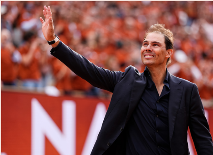
Rafael Nadal waving to the fans at the farewell ceremony

Rafael Nadal is the King of Clay and he just had the most emotional goodbye at his favourite place: Roland Garros in Paris!