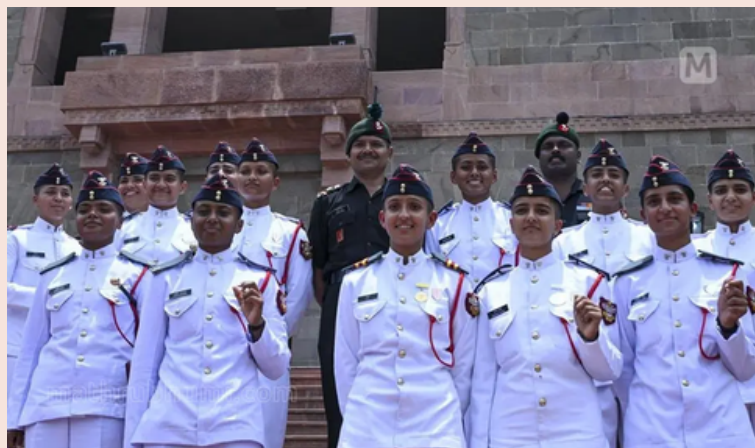
First batch of women cadets at NDA