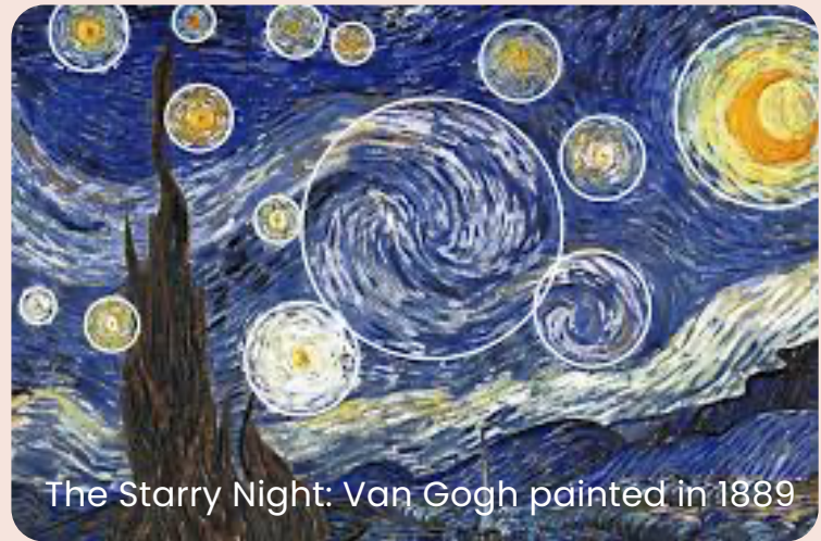
The Starry Night: Van Gogh painted in 1889